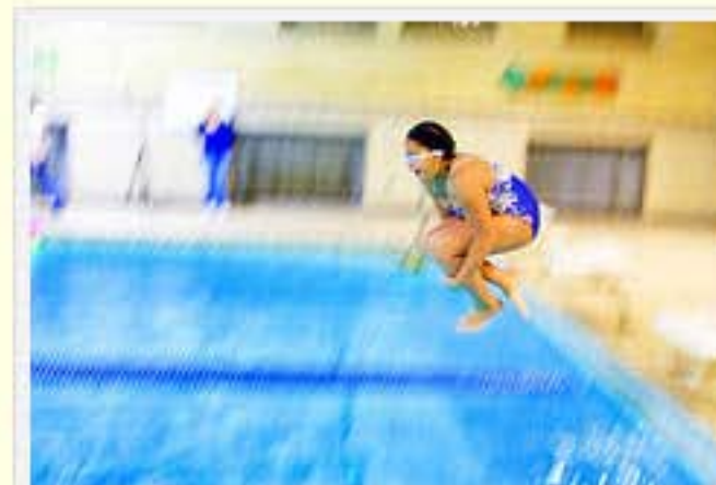
Swimming at the Boys' and Girls' Club in Pittsfield, MA

When February vacation arrives, school hallways fall silent. It's a time to rest and regroup for students and teachers alike, but at the Boys' and Girls' Club , it marks one of the busiest times of the year.